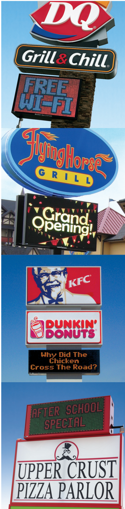
35mm Color Decatur, IL Matrix: 40 x 64 5' H x 8' W