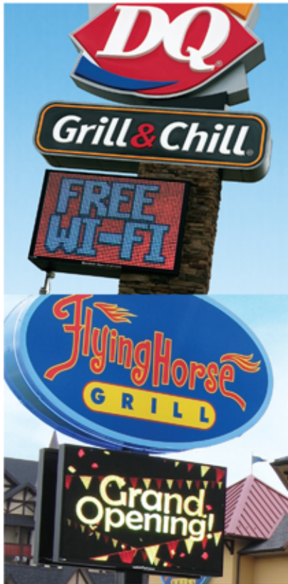
35mm Color Decatur, IL Matrix: 40 x 64 5' H x 8' W