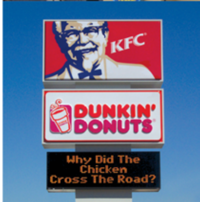
35mm Amber Pottsville, PA Matrix 32 x 96 4' H x 12' W