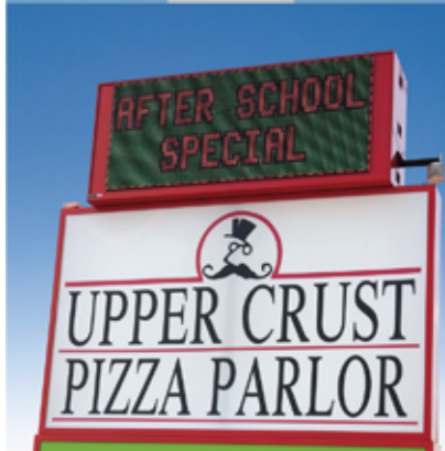
19mm Color Winston-Salem, NC Matrix: 48 x 112 3'4" H x 8' W