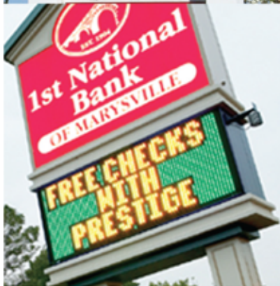
35mm Color Marysville, PA Matrix: 24 x 64 3'1" H x 8' W