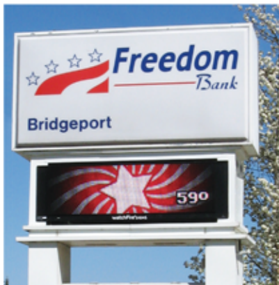
19mm Color Bridgeport, WV Matrix: 32 x 112 2'4" H x 8' W