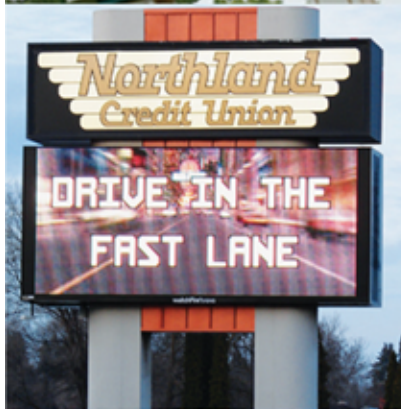
XVS 19mm Color Spokane, WA Matrix 80 x 176 5'4" H x 12' W