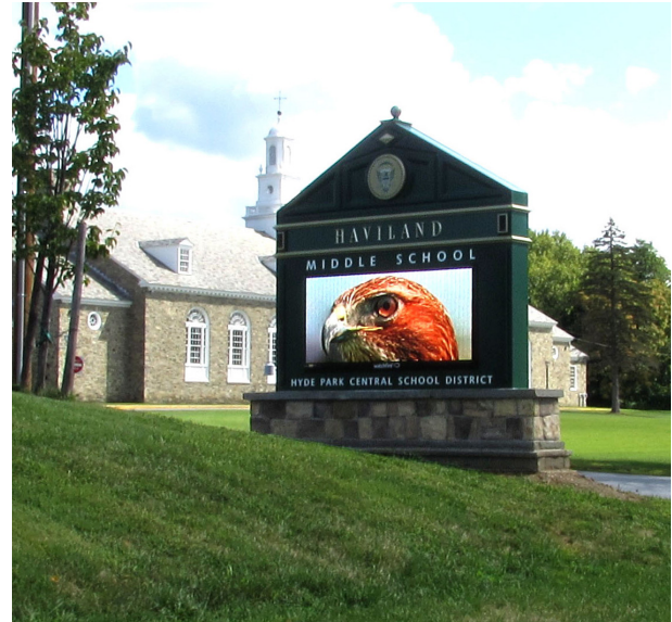
W 12mm 72 x 168 • 41" x 7'3" Haviland Middle School • Hyde Park, NY

For more information, contact your Watchfire representative.