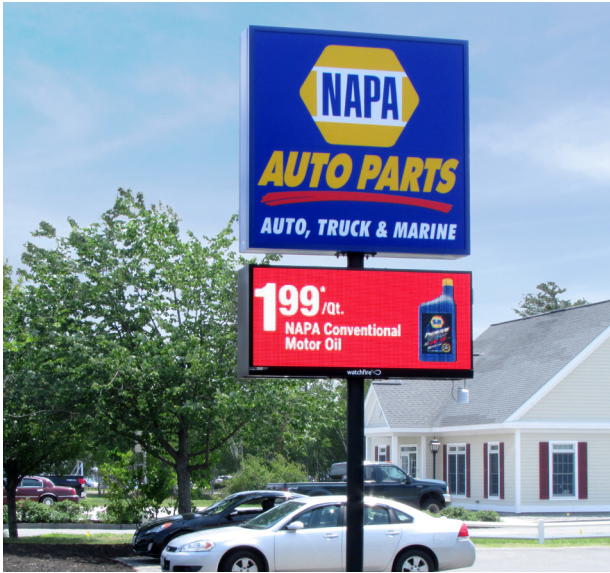
W 12mm 72 x 168 • 41" x 7'3" Napa Auto Parts • Windham, ME

The XVS advantage is an available option, providing live video capability, whole-sign calibration, and automated sign diagnostics.